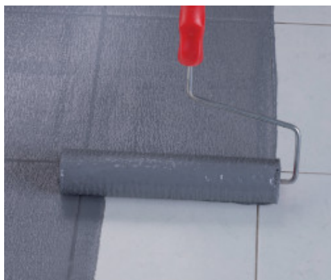
Application of Eco Prim Grip Plus by roller on existing porcelain tiles