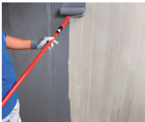
Application of Eco Prim Grip Plus on concrete by roller

If used as adhesion promoter for cementitious smoothing compounds on substrates treated with epoxy or polyurethane primers (such as Primer MF , Primer MF EC Plus , Eco Prim PU 1K , Eco Prim PU 1K Turbo ) without broadcasting of quartz sand, Eco Prim Grip Plus must be applied neat after complete drying and after max. 24 hours from the application of said primers. This type of application is possible in case of skimcoats of max. 10 mm and only if no application of hardwood is planned.